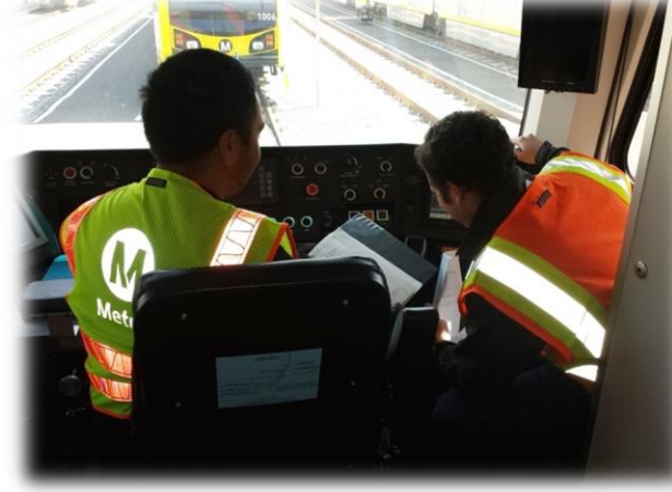
The new P3010 car testing