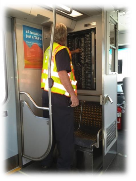
The new P3010 car testing