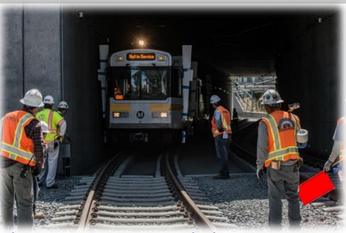
Clearance Train Testing inside the I-10 Box near at the Northvale Trench