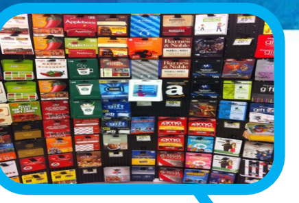
Gift Card > Programs