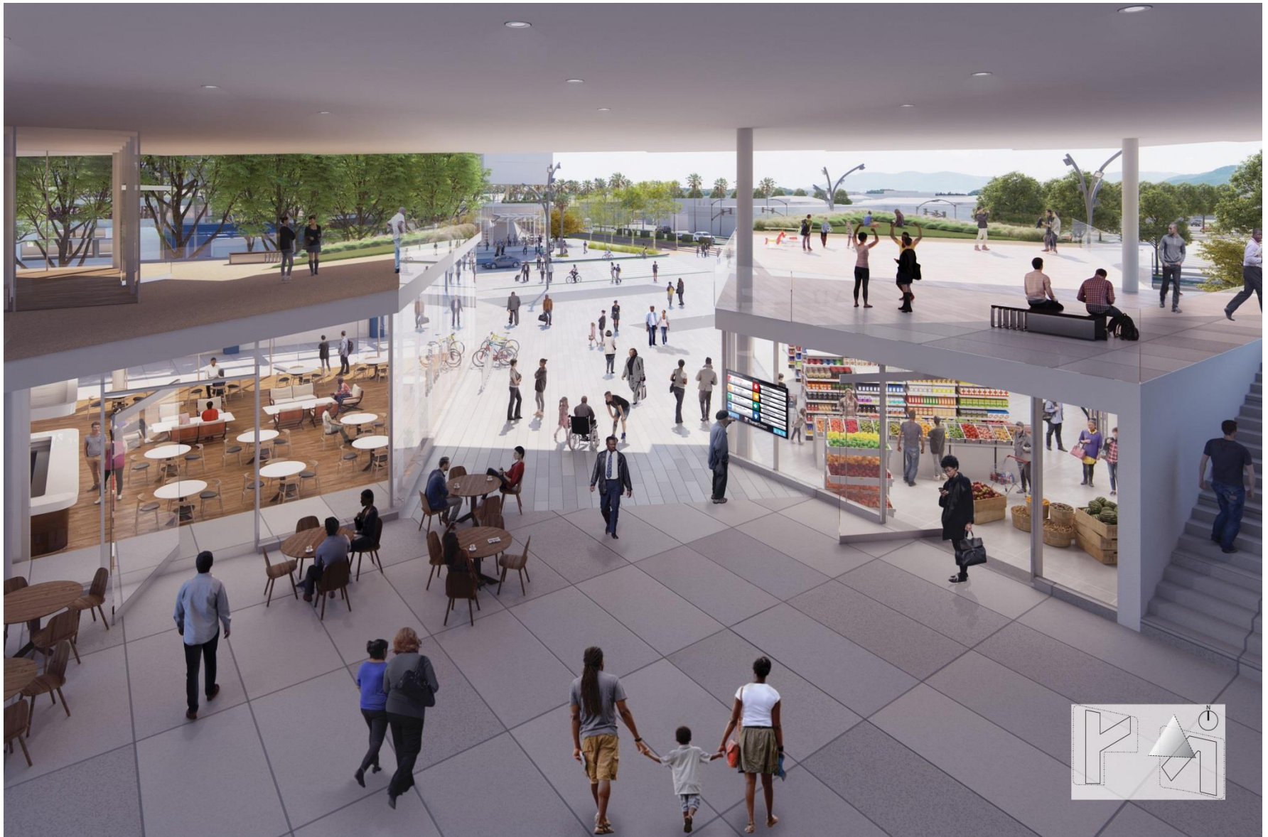
View of ground floor retail, Site B