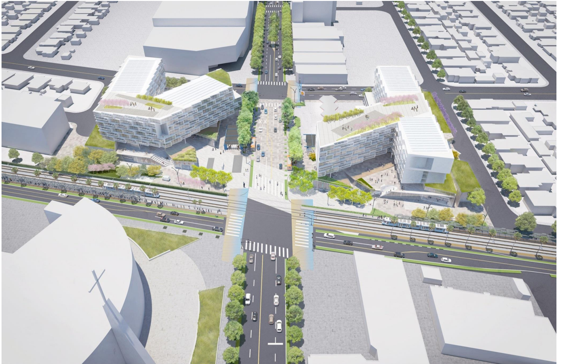
Perspective looking south