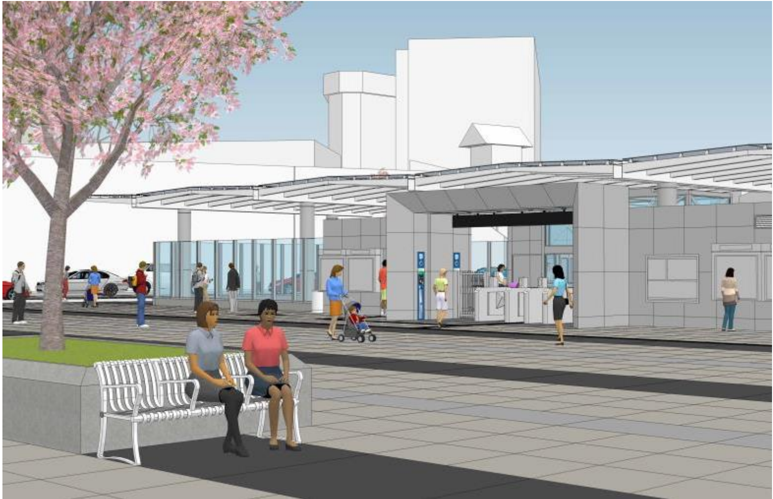
1 st /Central Station