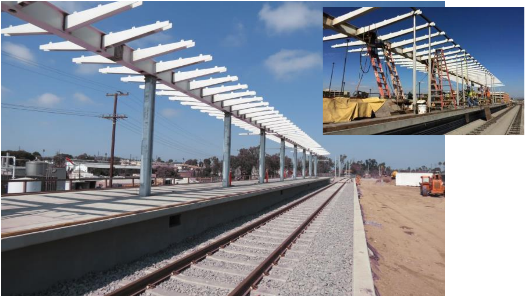
Downtown Inglewood Station