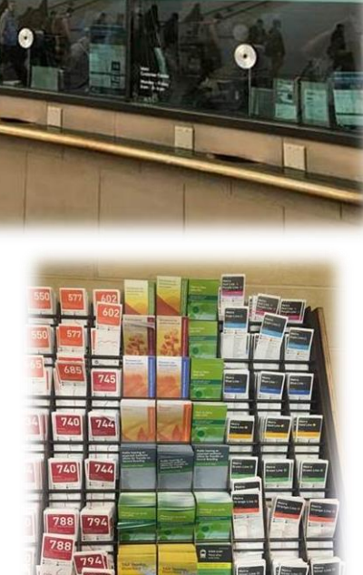
Take Ones on display

s now LIFE (Low-Income Fare is Easy). Learn more at ma