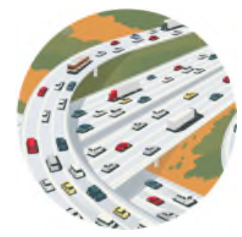
Congested Corridors Solution $200 million/year