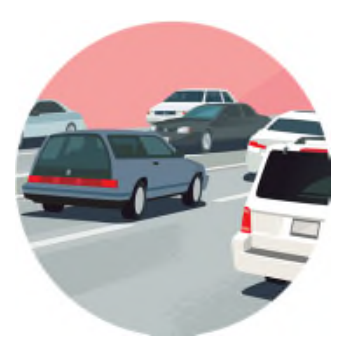
Highway Improvements $1.5 billion/year