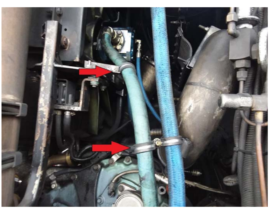
Hydraulic fan oil line securement