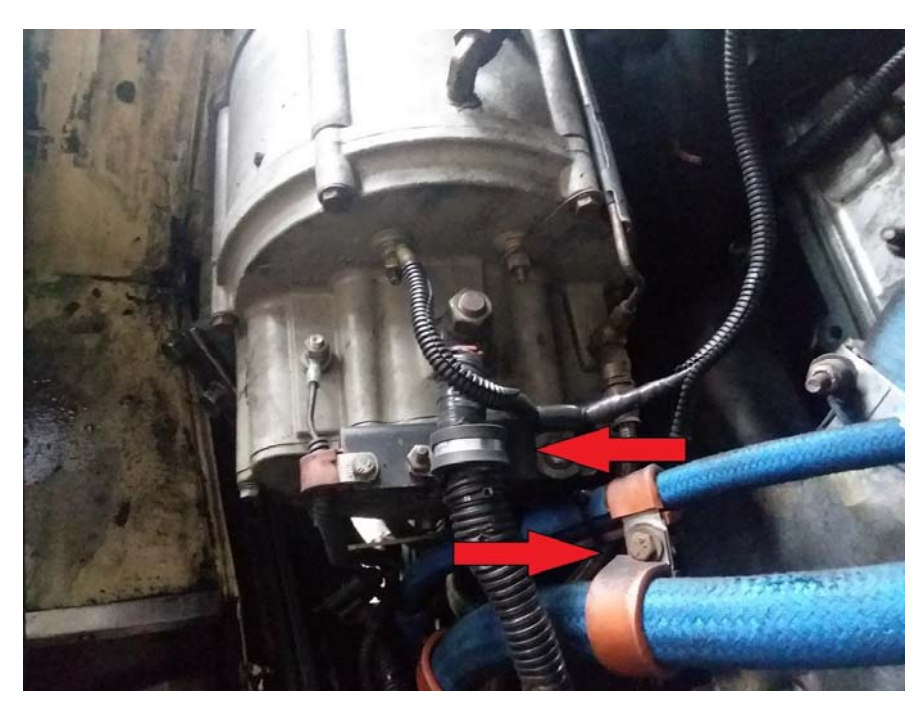
Alternator cable and hydraulic oil line securement