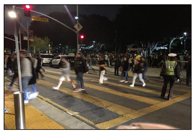
Expo Park USC Station /LAFC