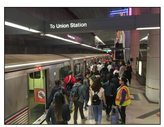
Riders exiting at Pershing Square for the Women's March Saturday, January 19, 2019