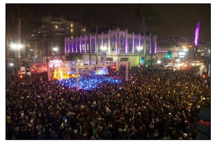
Long Beach NYE at Rainbow Harbor