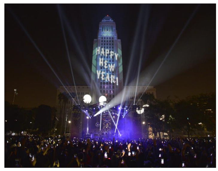
NYELA Grand Park