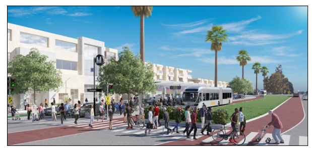
Figure ES-4: Center-Running BRT

This concept features 4.2 miles of center-running dedicated BRT lanes south of Gage Avenue, where the ROW widens significantly, and 8.2 miles of side-running dedicated BRT north of Gage Avenue. South of Gage Avenue, the corridor widens to three travel lanes in each direction and includes sufficient ROW to accommodate centerrunning BRT lanes. The center bus lanes would be accommodated by converting the two center traffic lanes to bus lanes as shown in Figure ES-4. Because the ROW is generally narrower north of Gage Avenue, center-running BRT lanes would require considerable ROW acquisition. Therefore, side-running dedicated bus lanes are proposed north of Gage Avenue.