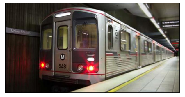
Figure ES-8: HRT Example: Metro Red Line

4 Heavy Rail Transit (HRT) is the technology used on the Metro Red and Purple Lines and would be compatible with the existing HRT fleet and vehicle maintenance yards.