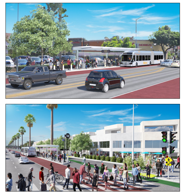
Figure ES-3: End-to-End Side-Running BRT

This concept features a dedicated bus lane along the entire 12.4 mile corridor within the existing ROW. Room for the bus lanes would be made available by converting the general purpose lane (one in each direction) adjacent to the curbside parking lanes to a dedicated bus lane. BRT stations with a number of passenger amenities including shelters, bus benches, trash cans, next bus information, and lighting, would be located on the sidewalks and, in most cases, far side of the intersections, as shown in Figure ES-3.