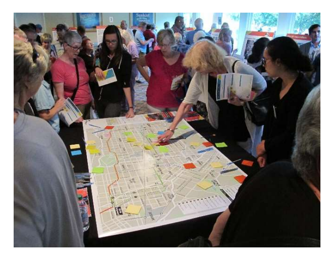
August 12, 2019 Northridge Meeting

• Approximately 15 letters from organizations and elected officials were received as of September 23, 2019.