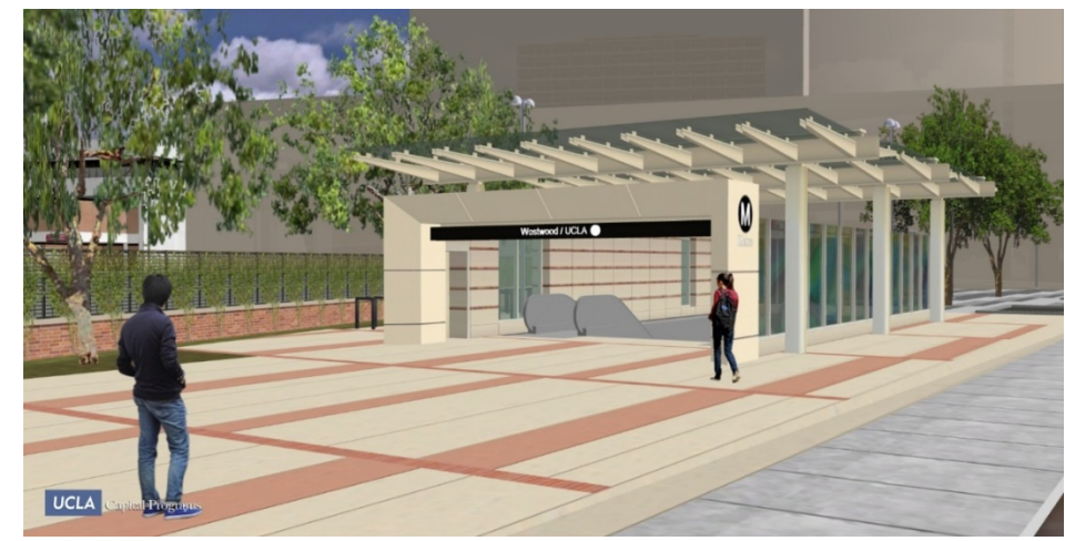
Station entrance with UCLA requested finishes