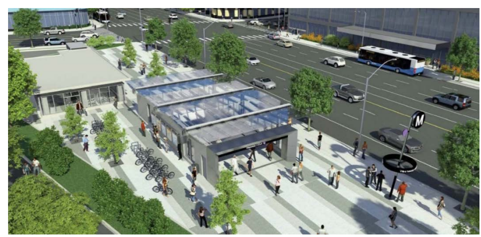
Station entrance with Metro standard finishes