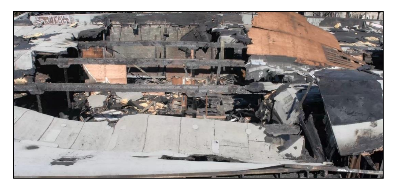
Figure 7. Citizens Warehouse/Lysle Storage Company (Pickle Works). Drone footage of southern portion. Looking north, northeast, and downward. Zephyr UAS: November, 2018.