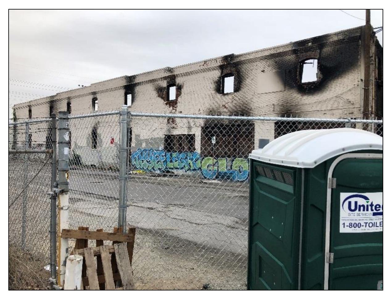
Figure 9. Citizens Warehouse/Lysle Storage Company (Pickle Works). North elevation. Looking southeast. ICF: November, 2018.

Page 11 of 21 *Resource Name or # Citizens Warehouse/Lysle Storage Co.