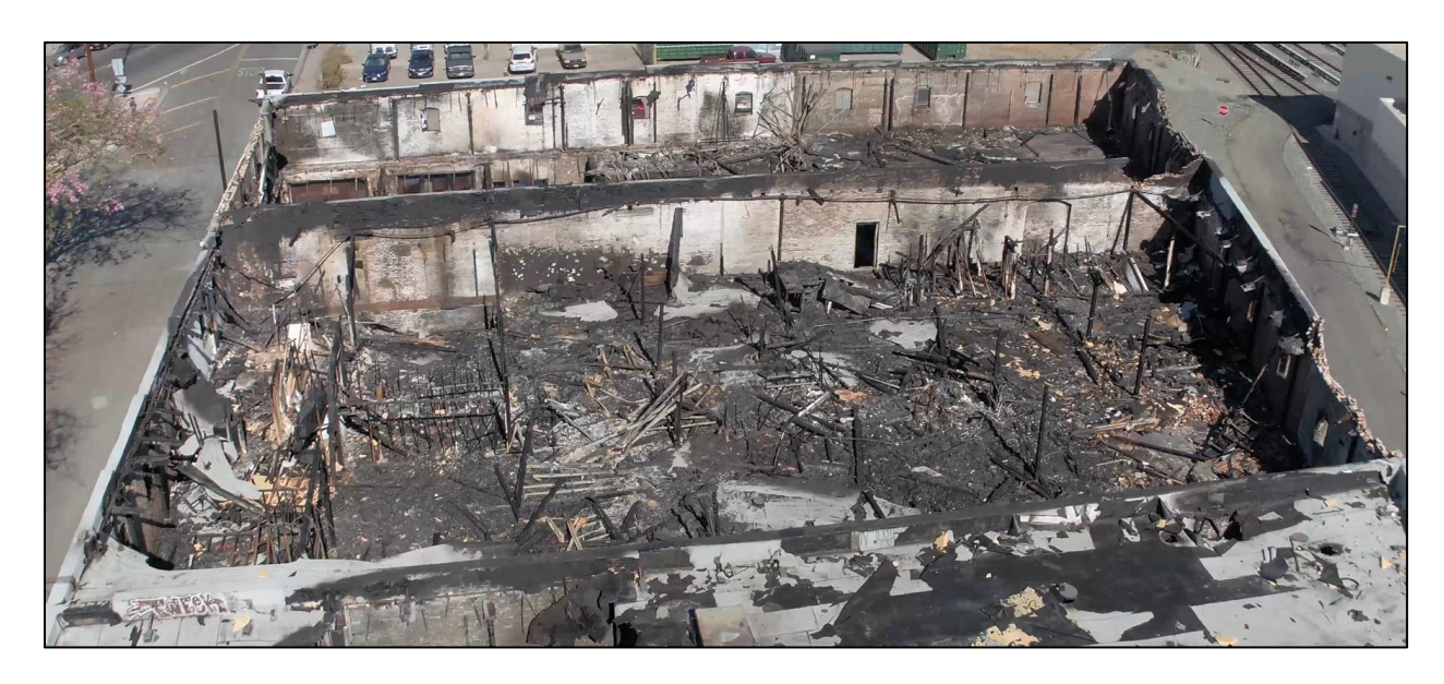
Figure 6. Citizens Warehouse/ Lysle Storage Company (Pickle Works). Drone footage of north and central portions. Looking north, northeast, and downward. Zephyr UAS: November, 2018.

Page 9 of 21 *Resource Name or # Citizens Warehouse/Lysle Storage Co.