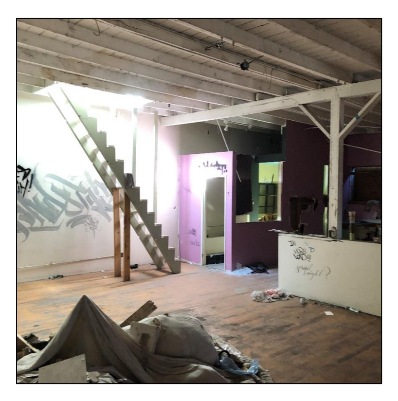
Figure 2. Interior, second level, facing SW. As an early artist loft, the combination of recent, ad-hoc elements to make spaces livable coupled with original design features of the early twentieth century building, were, taken together, a primary character-defining feature. ICF, August 2018.

Page <u>5</u> of <u>21</u> *Resource Name or # Citizens Warehouse/Lysle Storage Co.