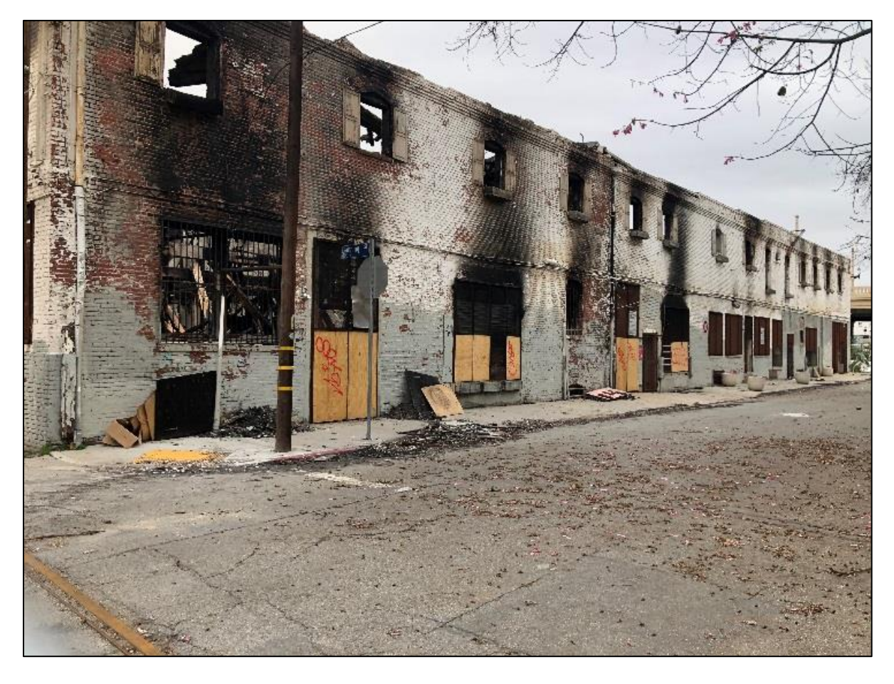
Figure 8. Citizens Warehouse/Lysle Storage Company (Pickle Works). West elevation. The former Art Dock is the last loading bay to the right with the single wood board over it. Looking southeast. ICF: November, 2018.

Page 10 of 21 *Resource Name or # Citizens Warehouse/Lysle Storage Co.