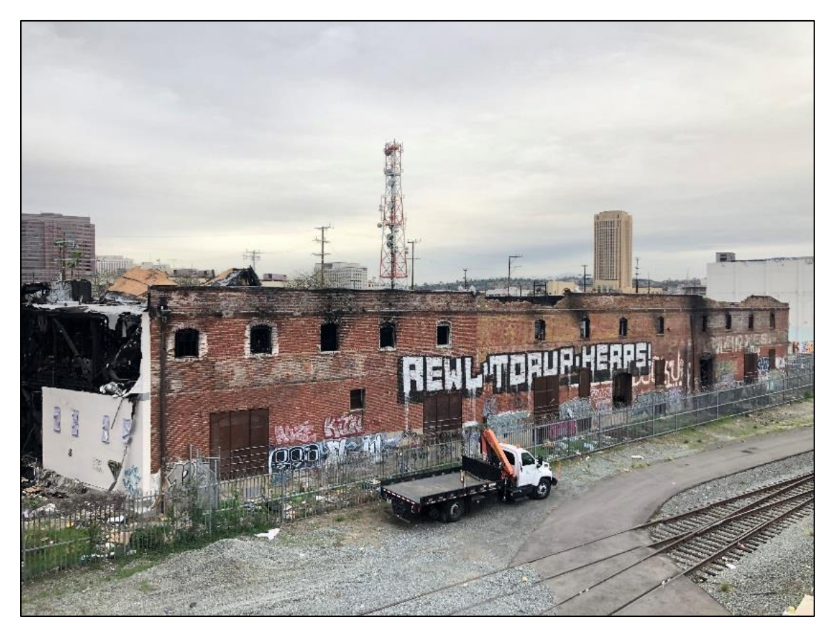
Figure 10. Citizens Warehouse/Lysle Storage Company (Pickle Works). East elevation. Looking northwest. ICF: November, 2018.

Page 12 of 21 *Resource Name or # Citizens Warehouse/Lysle Storage Co.