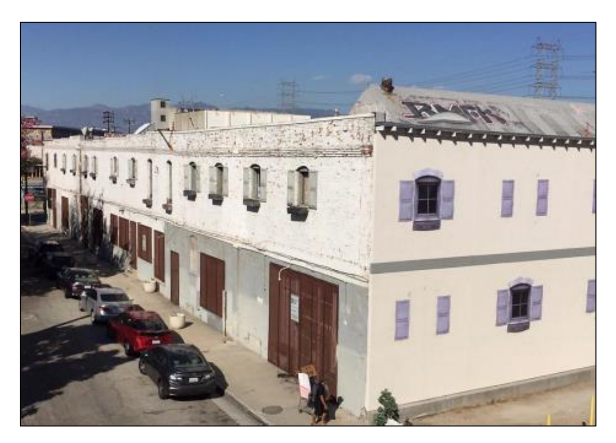
Figure 18. [Pre- Nov. 2018 Fire]: Citizens Warehouse/Lysle Storage Company, showing truncated south elevation to right of frame. View: NE. September, 2017.