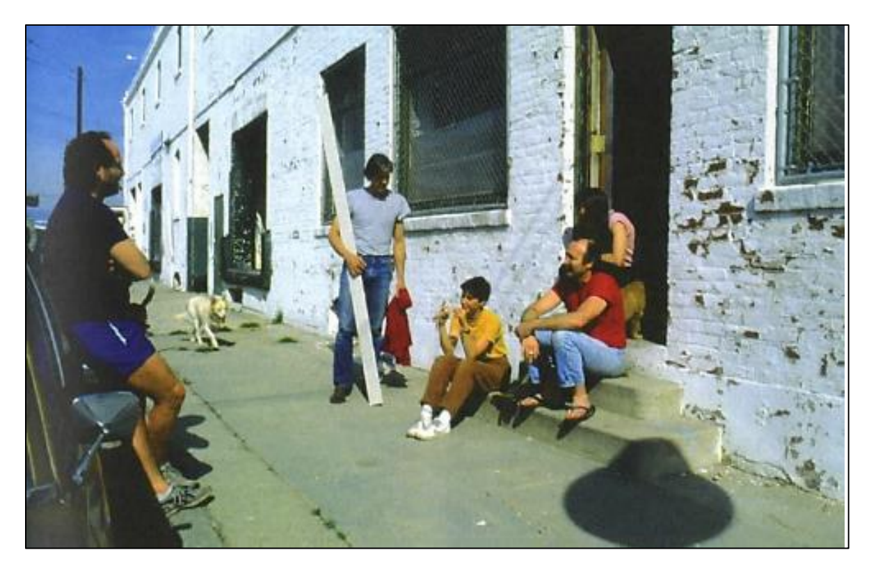
Figure 13. Artists at Citizens Warehouse c. 1981.

*Recorded by: <u>Daniel Paul</u> *Date <u>06/17/2019</u> Update