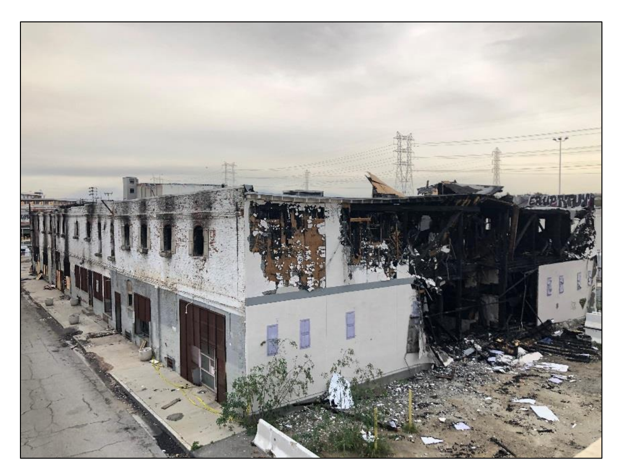
Figure 11. Citizens Warehouse/Lysle Storage Company (Pickle Works). West and south elevations. Looking northeast.