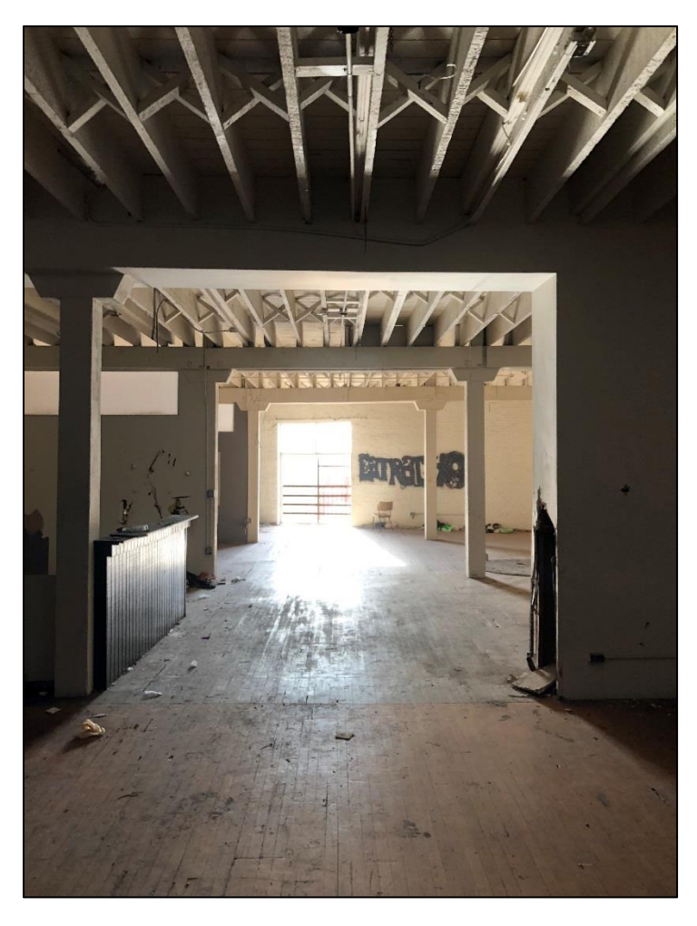
Figure 4. Interior, first level. Facing east. As an early artist loft, the combination of recent, ad-hoc elements to make spaces livable coupled with original design features of the early twentieth century building, were, taken together, a primary character defining feature. ICF, August 2018.