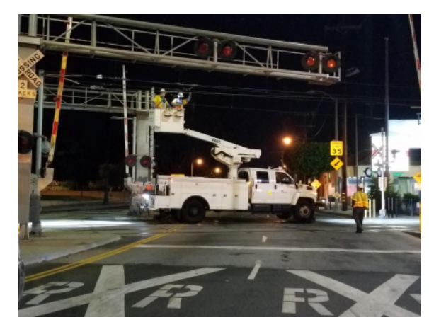
Traction Power Staff On-Site