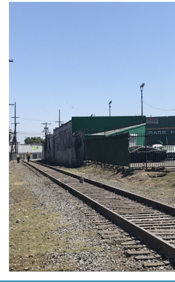
New Security Measures at Harbor Subway Station (Slauson/Western Ave)