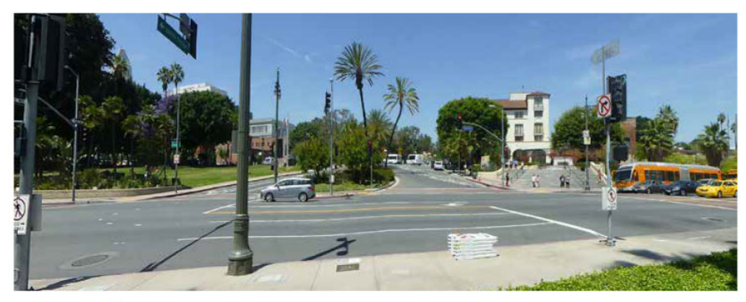
EXISTING View from Union Station west up Los Angeles St. to El Pueblo