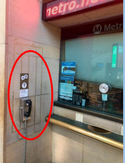
East Portal Customer Center