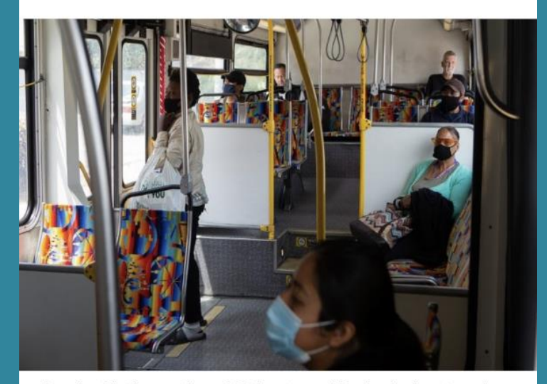
People ride the westbound 33 bus toward Venice in downtown Los Angeles on April 19.

Don't let the coronavirus destroy public transit too