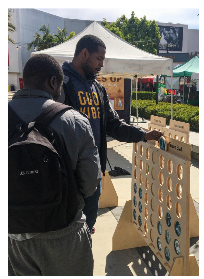
February 2020 Crenshaw Farmers Market First/Last Mile "Pop-Up" Booth