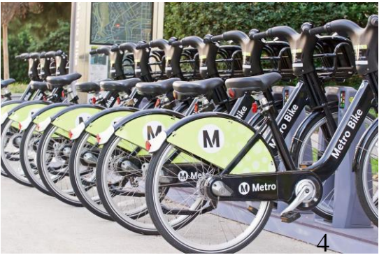
Active Transportation Eacilities