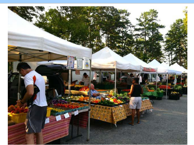
Station area programming