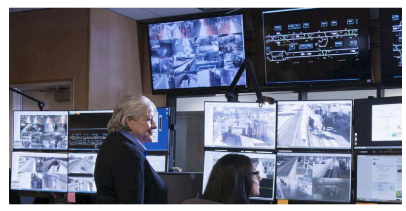
LA Metro's Emergency Security Operations Center