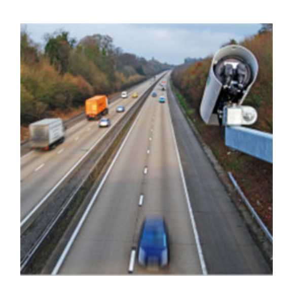
High Speed Wireless Cameras