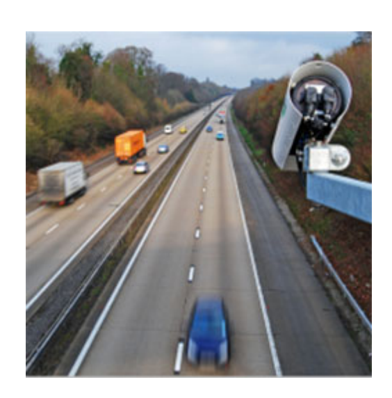
High Speed Wireless Cameras