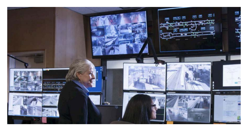
LA Metro's Emergency Security Operations Center