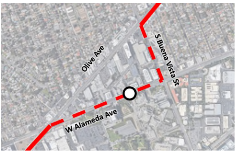
Proposed Alameda/Buena Vista Reroute