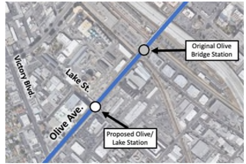
Proposed Olive/Lake Station