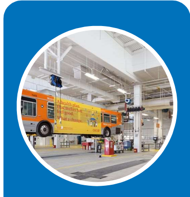
<u>Other</u> Facilities Maintenance Bus Maintenance Regional & Hubs Technology Non-Revenue Vehicles/Other SGR