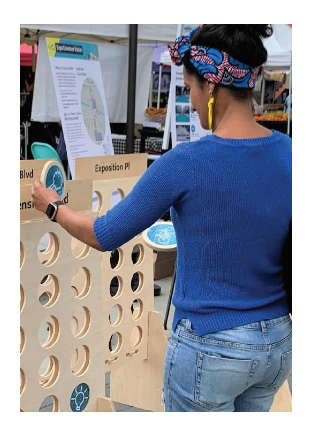
Pop-up event at Crenshaw Farmers' Market