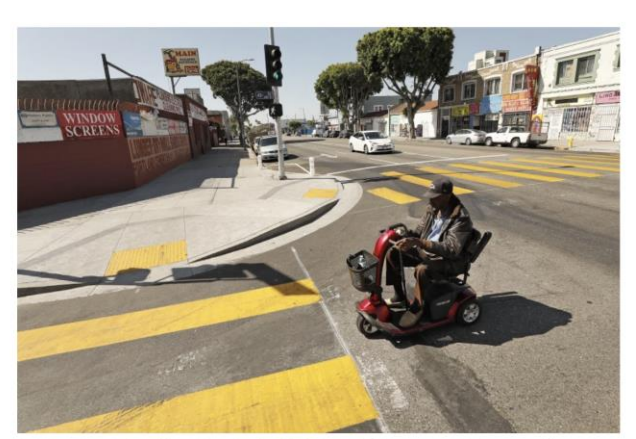
To help reduce fatal traffic crashes, the city of L.A. has added new crosswalks that extend further into the street, such as this one at 43rd and Broadway.

Op-Ed: People of color are dying from traffic violence at a much higher rate. Here's why