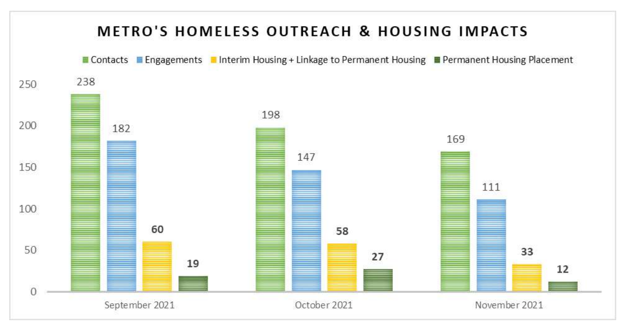
Figure 1. Metro's Homeless Outreach and Housing Impacts September - November 2021.

Contacts and Engagements are the first steps to connecting unhoused Metro riders with the housing and services they need. The Interim Housing, Linkage to Permanent Housing and Permanent Housing Placement grapph shows the number of individuals that Metro has been able to connect with housing. This is a key indicator that Metro's funding for these efforts shows that we are a partner in the fight to end homelessness in LA County.